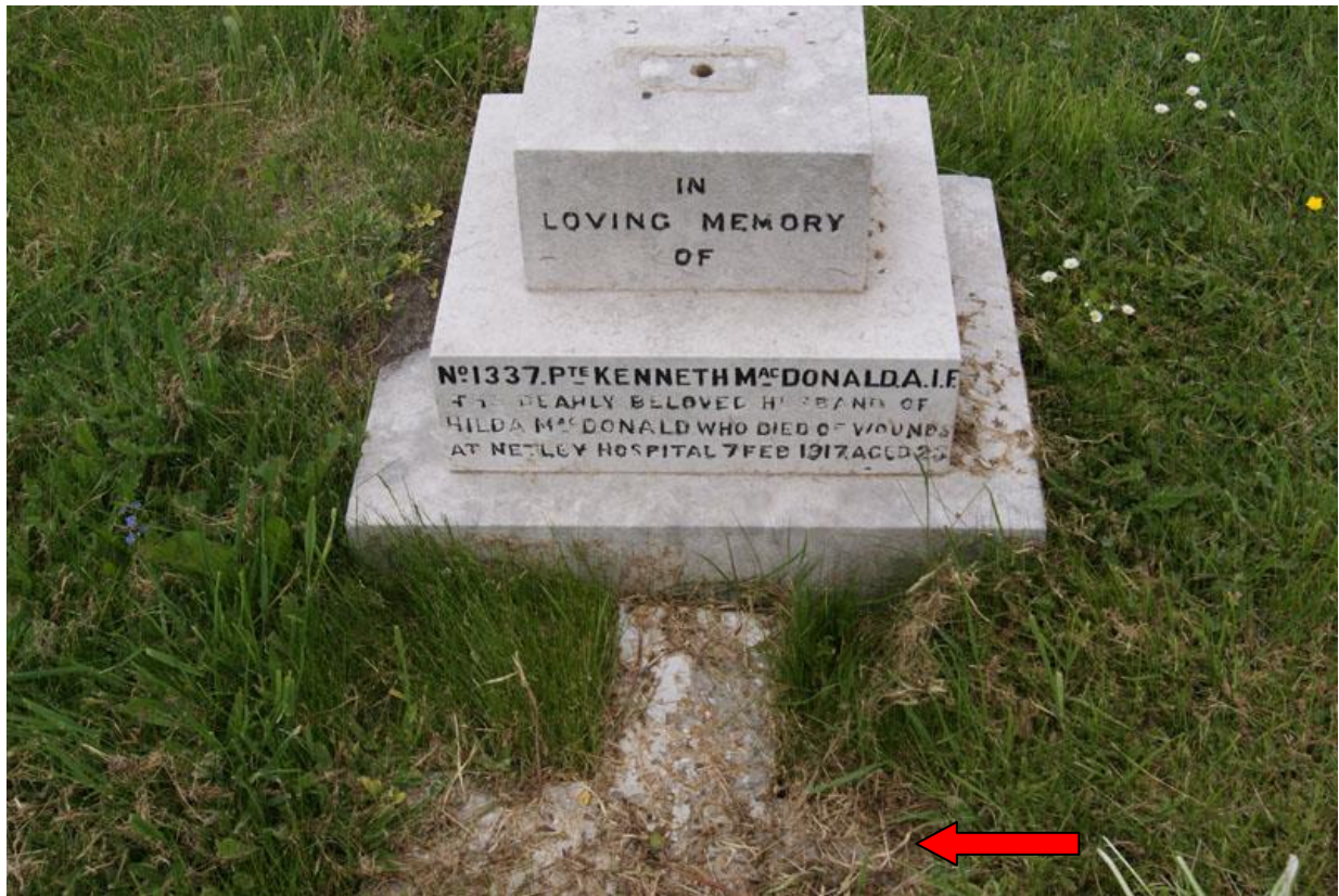
The above photo shows the marble cross which has fallen & is on the ground in front of the base