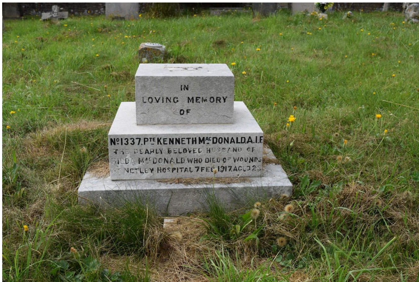
Photo of Pte Kenneth MacDonald's Commonwealth War Graves Commission Headstone in Fordington Cemetery, Dorchester, Dorset, England.